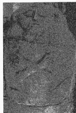
Fig. 11-6. Anthropoid sarcophagus from Deir el-Balah, near Gaza. (Dayan Collection, Israel Museum;)